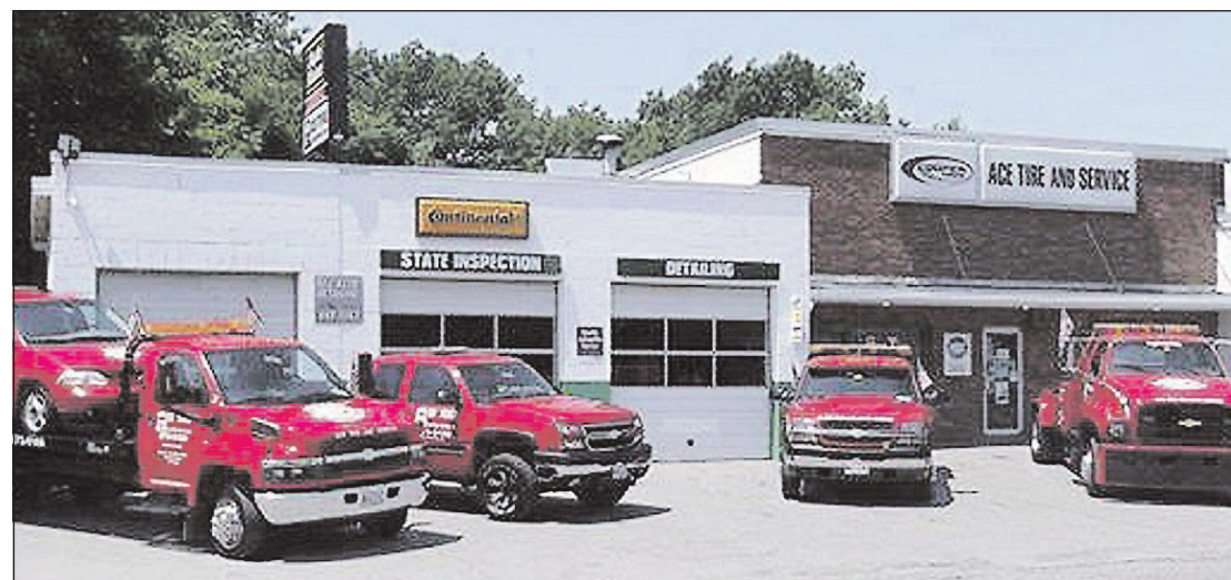
Ace Tire & Auto Service photo

"We're the only independent repair facility in